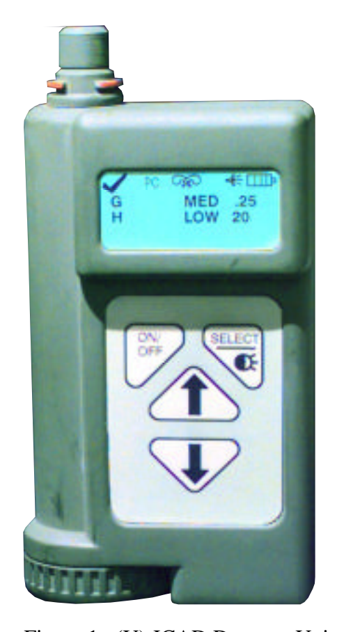
Figure 1. (U) JCAD Detector Unit

(U) The heart of the JCAD is the detector unit shown in Figure 1.