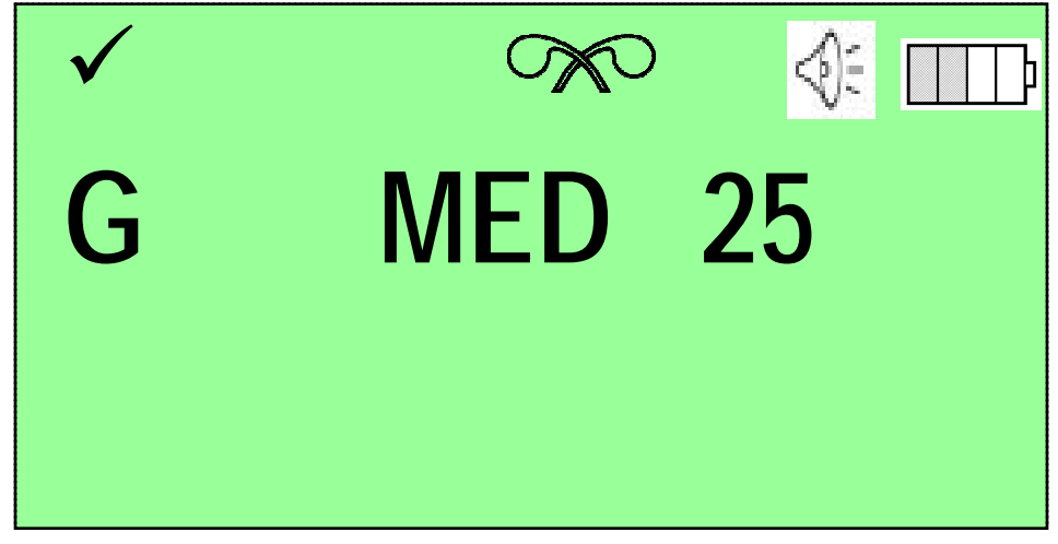
Figure 4: (U) Single Chemical Agent Challenge Screen

(U) The JCAD engineering and manufacturing development (EMD) is scheduled for the critical design review (CDR) in April 00. The program is led by the Air Force 311<sup>th</sup> Human Systems Wing at Brooks AFB, TX. The program is supported by the Army